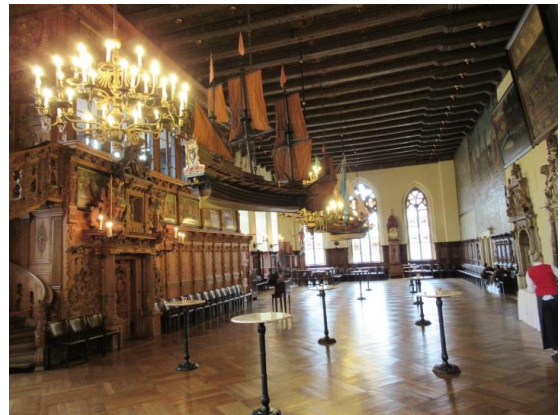
Meeting Room of the City Hall

That evening we went to the Rathaus (city hall), a UNESCO World Heritage Site, where we were welcomed by Senator Dr. Joachim Lohse, Senator for the Environment, Construction and Transport of the Free Hanseatic City of Bremen. The welcome was in a beautiful hall which dated back to the 1400's. After the welcome, we had a wonderful buffet dinner in the Ratskeller restaurant in the basement of city hall.