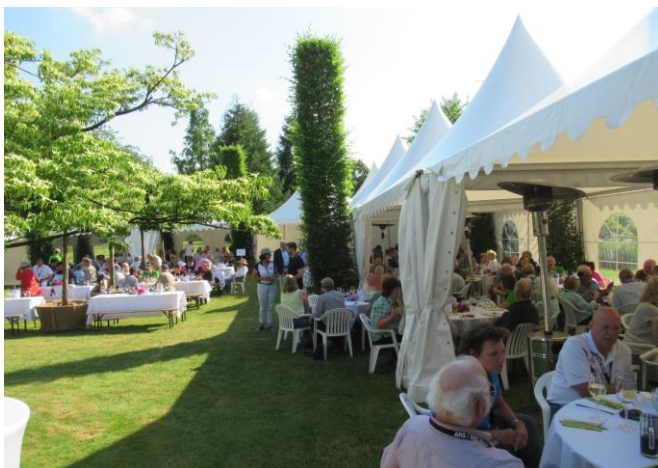
Final Dinner at the Bruns Nursery

evening with beautiful weather, good friends and good food.