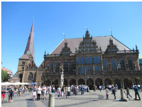
Bremen Rathaus (City Hall)