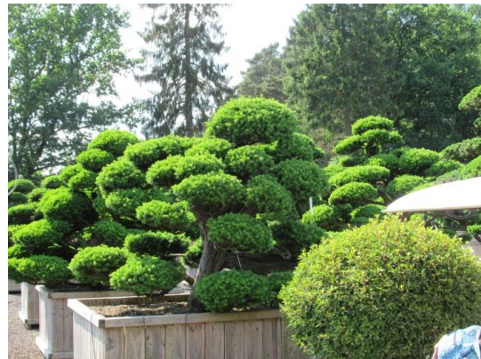
High End Topiary in Bruns Nursery

After our overview, we got onto trailers again for a hay ride through the high end of their inventory. We saw a large number of very mature, high quality plants. These plants, used by landscapers for well heeled customers could sell for € 20,000 ($24,000).