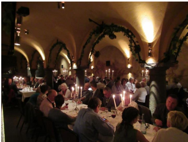
Dinner in the Ratskeller

Wednesday we hit the road heading towards Ammerland, the rhododendron growing area of Germany. We visited the Van der Berk nursery first. They raise their plants in the ground rather than in pots and the plants they sell are mainly to landscapers so they are much larger than those found in garden shops. They attempted to load a number of us on a device to lift us up into the air for a better view of the rhododendron fields, however once we were up in the air, the device malfunctioned (I guess we exceeded the maximum weight limit). They eventually