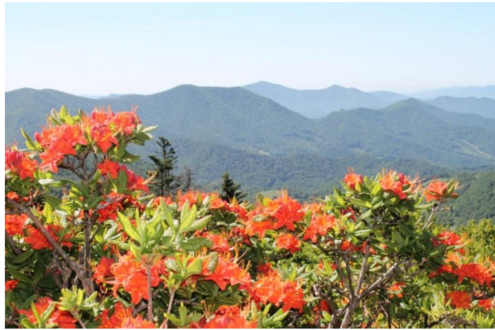
Calendulaceum on Roan Mountain