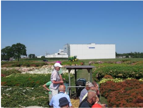
Touring Schroeder's Nursery

structure. To do this, they take plants with the characteristics desired by the customer and graft them to hearty root stock, using "Cunningham's White." This enables them to provide hearty plants...even in varieties which normally do not have a robust root system. He also gave us a quick demonstration of their grafting process.